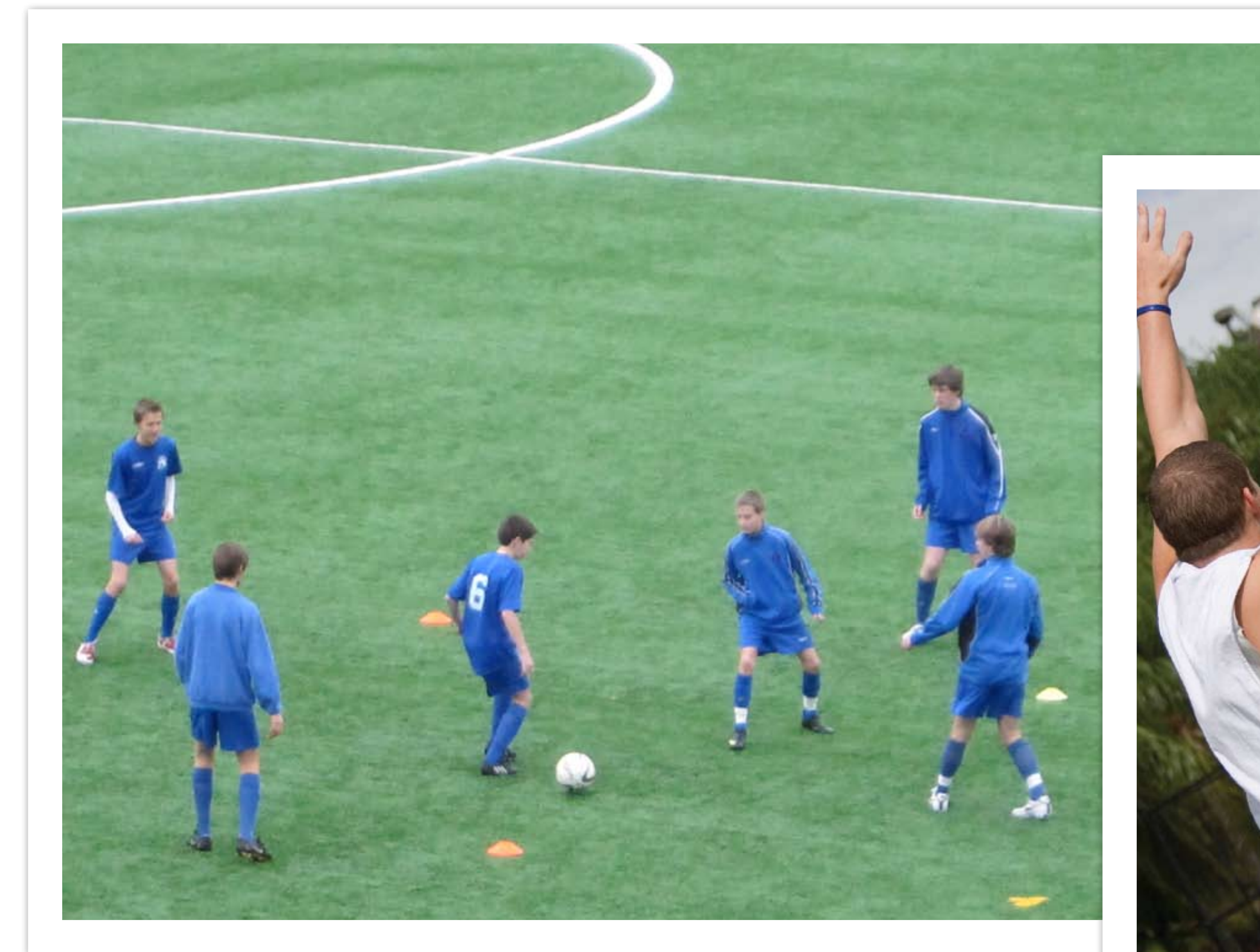
Half size all-weather field for six-a-side and outdoor physical education programs.