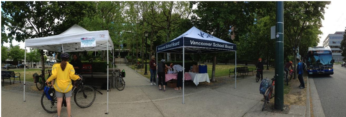
A bike-to-school/work week promotional event at the VSB education Center – located on the 10 th Ave bikeway

The VBE has participated in a number of activities that reduce GHG emissions in the community that are not specifically “in scope” for our carbon neutral required reporting. These typically focus on transportation of staff and students and include promotion of active transportation events (e.g. bike to school/work week) and working with the City of Vancouver’s Active Transportation Planning program to reduce congestion and improve active commuting to and from school sites.