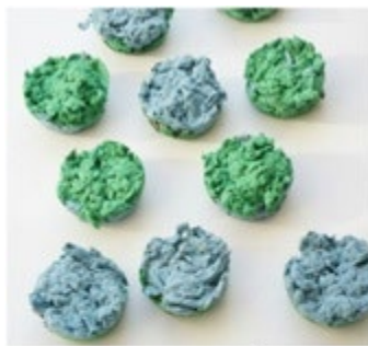
How to Make Wildflower Seed Bombs for Earth Day