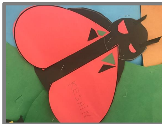
Imaginary Bug of the Amazon Rainforest by Keshin Div 5