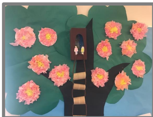
Cherry Blossom Tree and Treehouse by Div 5