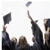
END-OF-YEAR Sports Day Support 7 th Grade Grad Support