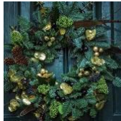
HOLIDAY FUNDRAISERS Purdy's Chocolates Wreaths & Poinsettias