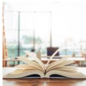
SCHOLARSHIP 12 th Grade Queen Mary Alumni Scholarship