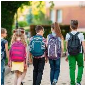
BACK TO SCHOOL Pizza Night Coffee Chats

Throughout the year, the Queen Mary PAC coordinates a variety of fundraising opportunities that are designed to raise funds to benefit the Queen Mary community, while providing fun, engaging opportunities for the community to get together. Here are some examples of how we get involved.