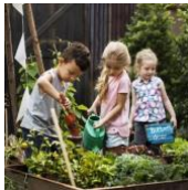
ENRICHMENT Classroom Gardener Babysitting / First Aid