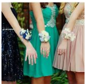
SOCIAL / COMMUNITY School Dance Bike-to-School Week