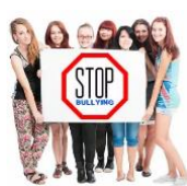
AWARENESS Pink Shirt Day