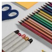
TEACHER SUPPORT Class supplies Field trips