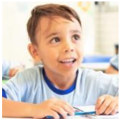
SISTER SCHOOL Holiday Hampers for Families Holiday Donation to PAC