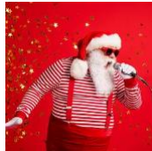
HOLIDAY FUN Craft & Bake Sale Holiday Singalong